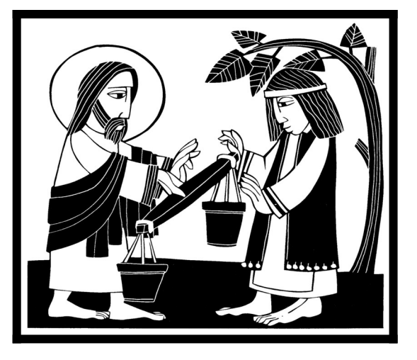
"Come to me, all you who labour and are overburdened and I will give you rest." (Gospel)