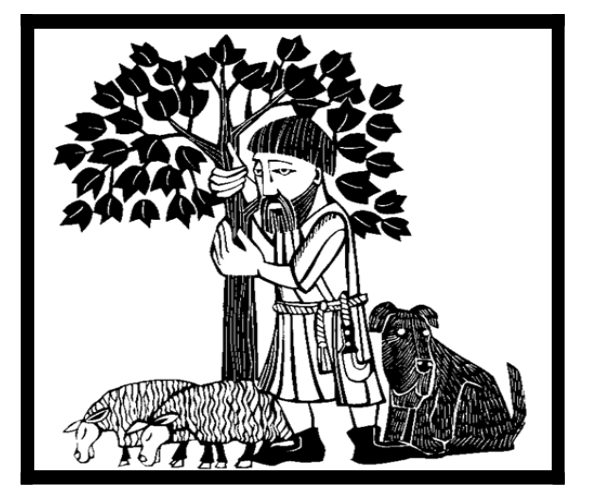
He instructed them to take nothing for the journey but a walking stick—no food, no sack, no money in their belts. (Gospel)