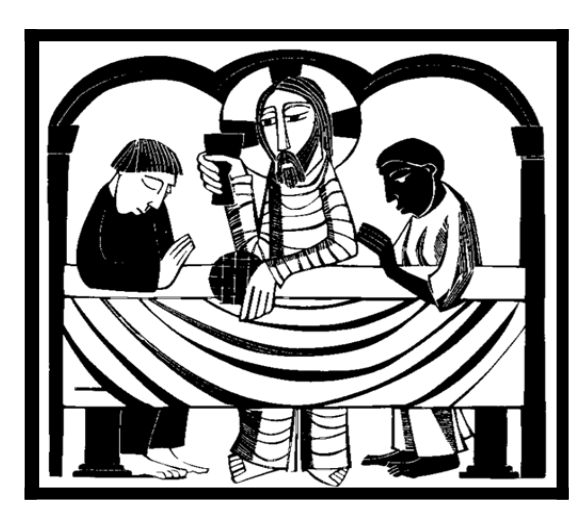
This people honours me only with lip-service, while their hearts are far from me.' (Gospel)